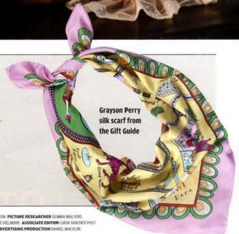
Grayson Perry silk scarf from the Gift Guide