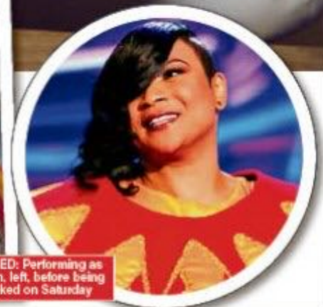
REVEALED: Performing as Harlequin, left, before being unmasked on Saturday